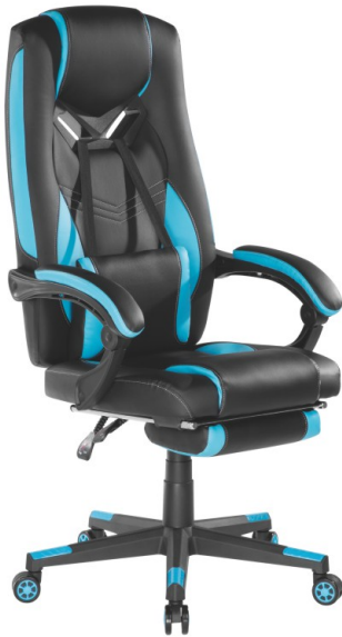
CH06-26 with Footrest

Dimensions: 63x71x119-129cm (24.8"x28"x46.9"-50.8") Weight Capacity: 150kg/330lbs Surface Material: PU Leather Tilt Range of Back: 150° Armrest Type: Height Adjustable Armrest Pneumatic Lever Type: 100mm Class 3 Gas Lift Base Type: 350mm Nylon Plastic Base Caster Type: 60mm Nylon Caster