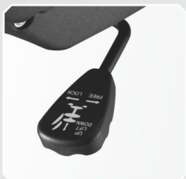
Rocking Start Lever