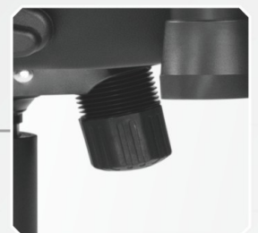
Rocking Angle Controller