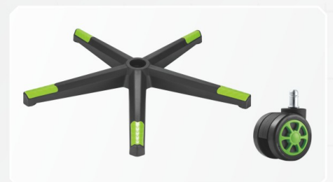
Nylon Star Base and Casters make smooth and light glides

All Chairs Can be Upgraded, Contact Our Sales for Further Information!