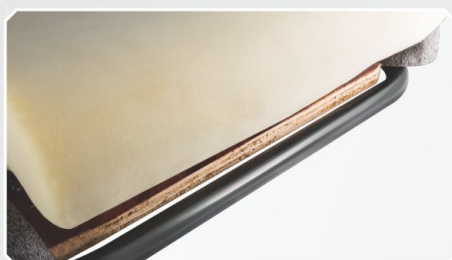
High Density Cold Molded Foam offers durable seating comfort