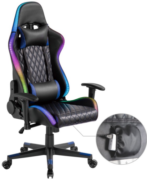
CH06-30 RGB function

Dimensions: 74x67x125-133cm (29.1"x26.4"x49.2"-52.4") Weight Capacity: 150kg/330lbs Surface Material: PU Leather Tilt Range of Back: 150° Armrest Type: 2D Armrest Pneumatic Lever Type: 80mm Class 4 Gas Lift Base Type: 350mm Nylon Plastic Base Caster Type: 60mm Nylon Caster