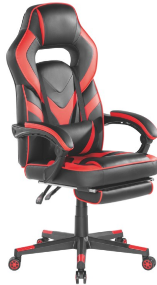
CH06-27 with Footrest

Dimensions: 63x71x119-129cm (24.8"x28"x46.9"-50.8") Weight Capacity: 150kg/330lbs Surface Material: PU Leather Tilt Range of Back: 150° Armrest Type: Height Adjustable Armrest Pneumatic Lever Type: 100mm Class 3 Gas Lift Base Type: 350mm Nylon Plastic Base Caster Type: 60mm Nylon Caster