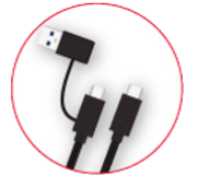
USB-C Data Cable With USB-A Adapter